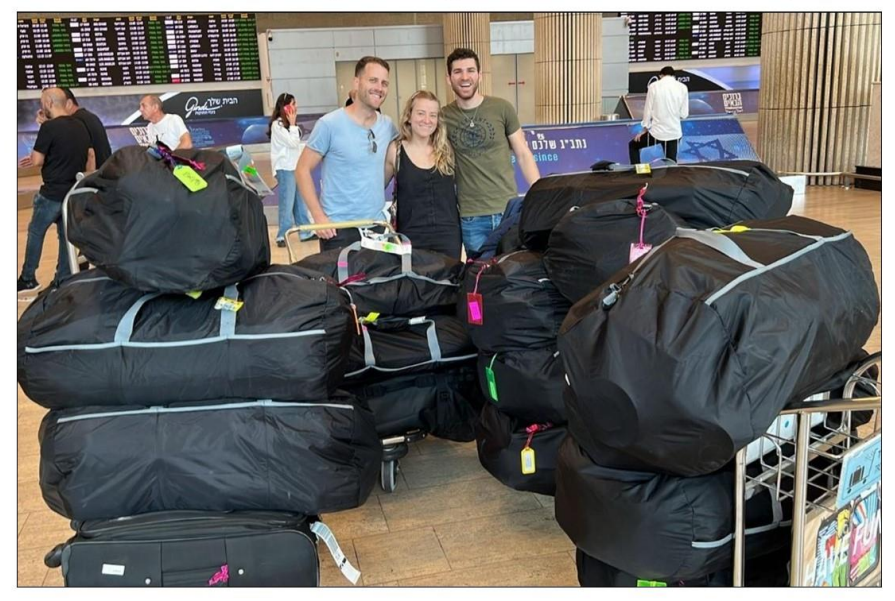
and three of our drivers collecting them at Ben Gurion Airport.